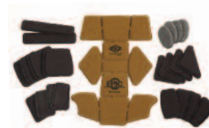
EPIC Pad System Also available in black