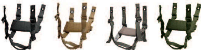
ASPS H-Back System. Retention System available in Black, Tan, Foliage Green or Olive Green.

Final retention construction may differ from photos shown.