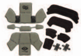
EPIC Air Liner System